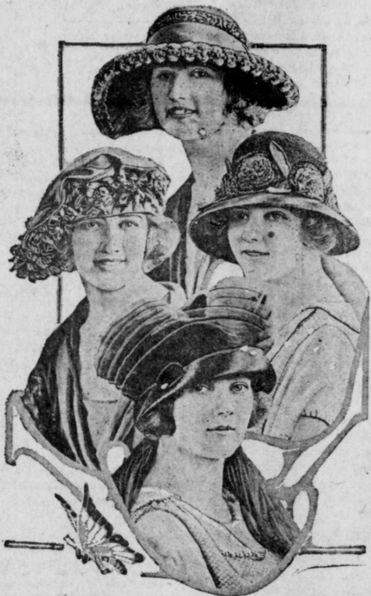
GROUP OF PRETTY BETWEEN-SEASONS HATS

Allegiance is divided between the straight silhouette and the fuller or circular skirt. The latter has more youthful line, but its appeal is not as universal as that of its popular rival;