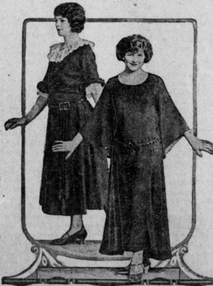
TWO EXAMPLES OF THE FULLER SKIRT

The dress at the left has a straight, wrinkled bodice with a waistline lower at the front than at the back. The full skirt is straight also. Frills of lace finish the round neck and elbow sleeves which terminate in a puff of