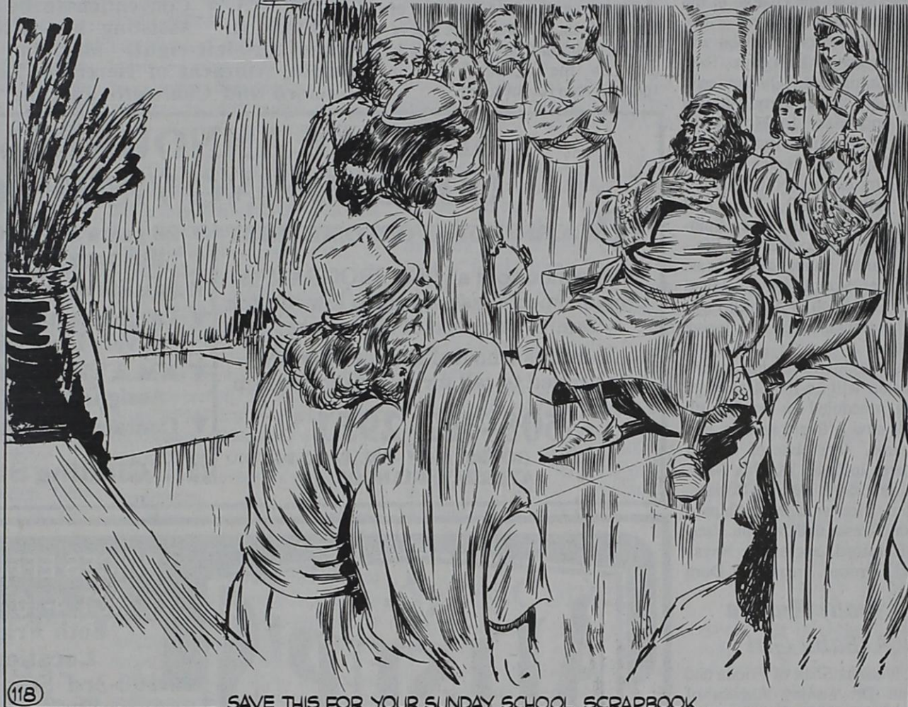
SAVE THIS FOR YOUR SUNDAY SCHOOL SCRAPBOOK

LANDOWNERS WERE THE MEN OF WEALTH AND AUTHORITY IN THE DAILY LIFE OF THE TYPICAL BIBLICAL VILLAGE. THEIR DOMAIN COULD BE CALLED A KINGDOM WITHIN A KINGDOM. THEY SET THE RULES OF BEHAVIOR IN THEIR OWN COMMUNITY AND USUALLY INTERPRETED THE LAWS IN A MANNER WHICH WOULD BENEFIT THEM. AS CAN BE SURMISED, THERE WERE HONORABLE MEN AND THERE WERE VILLAINOUS MEN AMONG THIS CLASS OF AFFLUENT CITIZENRY. THE BEST OF THEM MADE SURE THE POOR WERE ALWAYS FED AND CARED FOR. BOAZ (THE BOOK OF RUTH) WAS THIS TYPE OF GENEROUS LANDOWNER. AT THE OTHER END OF THE SCALE WE FIND THE TYPE OF RICH MAN OF WHOM JESUS SPOKE SO DISDAINFULLY, TAKING ADVANTAGE OF THE NEEDY AND HAGGLING OVER THEIR MEAGER WAGES WHILE CHEATING THEM IN THE BARGAIN. HOWEVER--HONORABLE OR VILLAINOUS-- THE WEALTHY MEN OF THE VILLAGES INFLUENCED THE LIFE OF EVERY INHABITANT WHO CAME UNDER THEIR JURISDICTION.