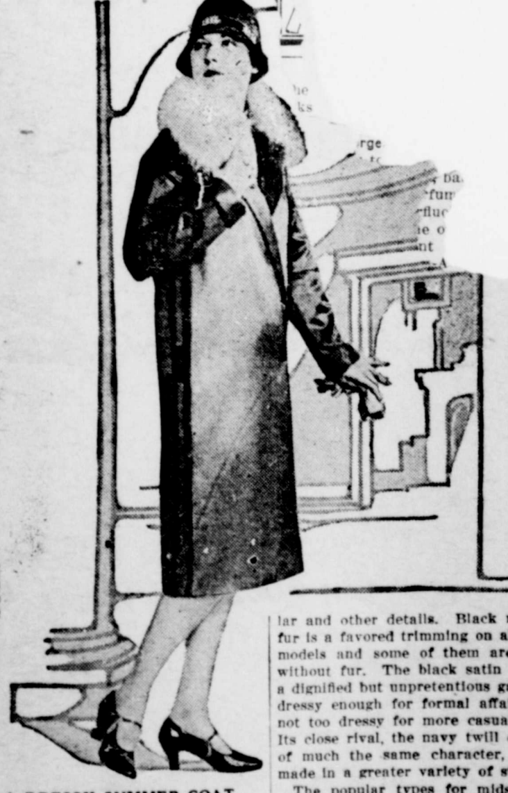
A DRESSY SUMMER COAT

en cloth in a light weight. It has patch pockets covered with a tracery embroidered in silver and black and banding adorned in the same way furnishes the collar and cuffs and finish for the edges. It is as simple as possible, trim and quite dignified. Its life companion is a gay, red skirt made of flannel with wide plaits arranged at the sides. Together they make an outfit which will carry one through many a summer day—especially if summer days are spent at resorts and filled with the usual pastimes. J. Regney is represented by a smart one-piece dress, which will fit in with town or country backgrounds. Beige flannel, barred with black, was chosen