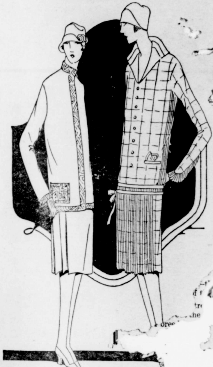
TWO DAY DRESSES FROM PA...

lights. In these the are liked best and jersey cloth is crepe de chine in t. Just what type of suited to her needs is a question the good judgment of the woman must decide for she starts out in quest mer coat. Usually she is practical as well The season provides consideration, beginn. plainer utility coats and advancing through styles that are more einbo-