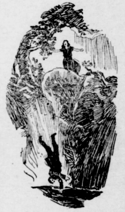
"Bete Noir! Bete Noir!"

McTaggart did not hurry to overtake Nepeese. She was following the narrow path deeper into the forest, and he was glad of that. They would be alone—away from Pierrot. He was satisfied to let her go on. When she