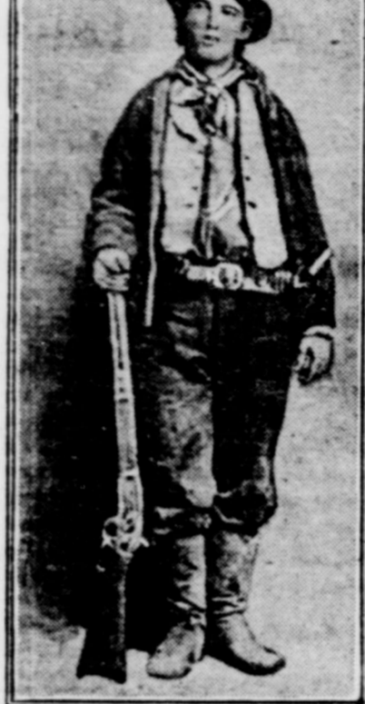
BILLY THE KID