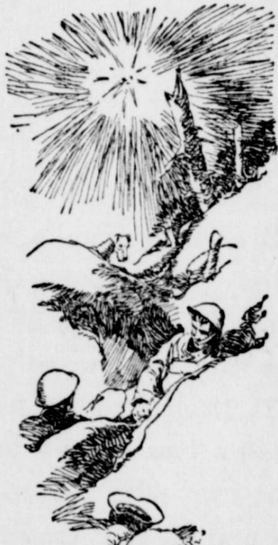
"You See He Found Two of Us."