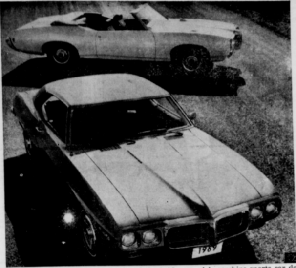
Both the 1969 Pontiac Firebird and the LeMans models combine sports car design and big car luxury. The Firebird, represented above by the hardtop coupe, is also available in a convertible model. A choice of five engines and now a three-speed Turbo Hydra-matic transmission option make the Firebird one of America's most popular sports cars. The LeMans convertible, along with the two-door sports coupe, two-door hardtop coupe, four-door hardtop and station wagon feature new interior fabrics and colors, draft free ventilation and additional padding for safety and comfort.