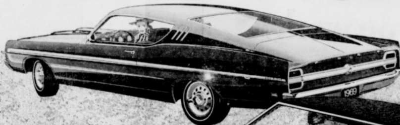
1969 Torino GT SportsRoof