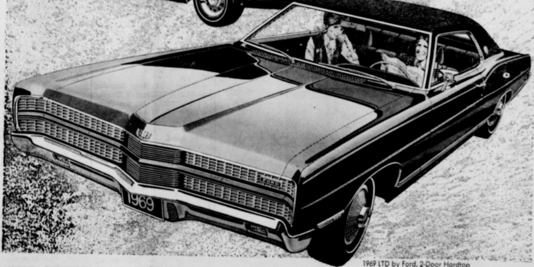
1969 LTD by Ford, 2-Door Hardtop

1969 Mustang. All new, all over! 5 great models. More engines than ever.