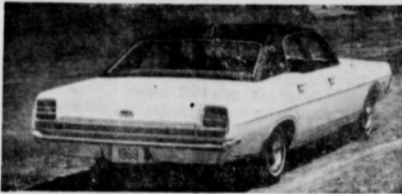
A strong contributor to Ford's hot-selling Fairlane line, the top-of-the-line Torino features distinctive improvements in 1969 while maintaining the popular design introduced last year. This Torino four-door sedan shows the new grille and taillamp design that highlight the exterior of the new models.