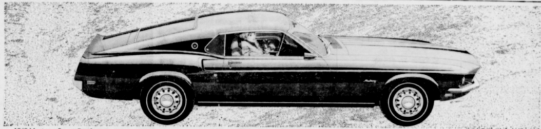
1969 Mustang SportsRoof