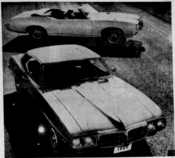
Both the 1969 Pontiac Firebird and the LeMans models combine sports car design and big car luxury. The Firebird, represented above by the hardtop coupe, is also available in a convertible model. A choice of five engines and now a three-speed Turbo Hydramatic transmission option make the Firebird one of America's most popular sports cars. The LeMans convertible, along with the two-door sports coupe, two-door hardtop coupe, four-door hardtop and station wagon feature new interior fabrics and colors, draft free ventilation and additional padding for safe-