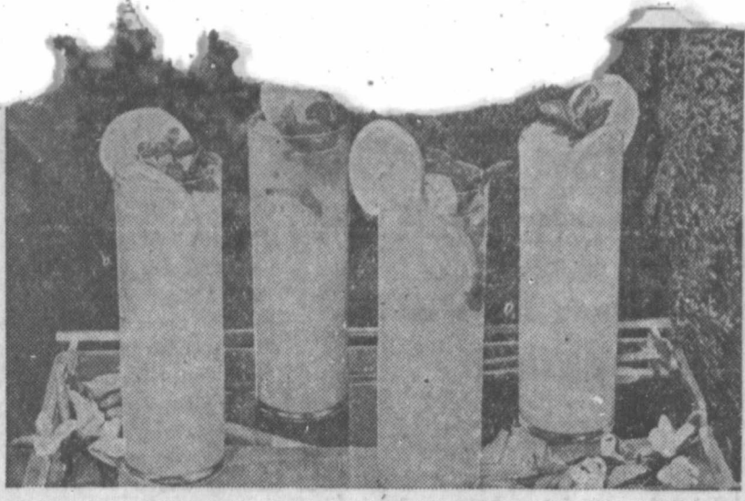
COOL DRINKS ARE REFRESHING ON HOT SUMMER DAYS (Recipes Below.)

After finishing a picture most stars make a great to-do about escaping Hollywood and its crowds to get away to some quiet place. But after finishing "The Howards of Virginia," Cary Grant rushed straight to Broadway, and Martha Scott headed for a crowded and fashionable hotel in Santa Barbara, Calif. Hats off to them! The stars who declare that they wish the public would let them alone are likely to rage and storm if people don't notice them—Garbo excepted, of course.