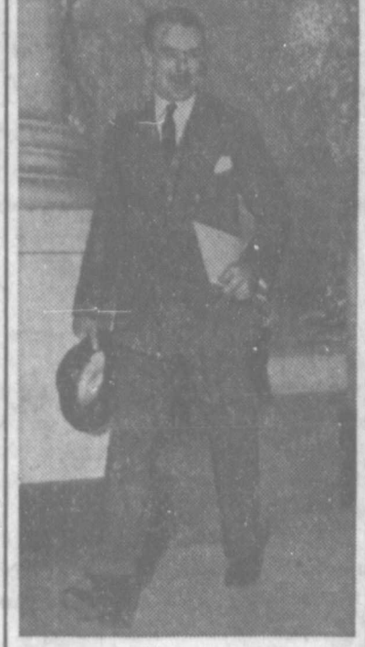
Australian Minister Richard G. Casey, arriving at the White House to confer with President Roosevelt on plans to aid Australia in its battle against Japan.