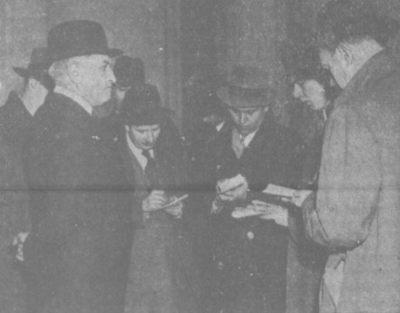
Justice Owen J. Roberts is shown (left) talking to newsmen after laying before President Roosevelt the report on the Pearl Harbor attack.

(EDITOR'S NOTE)—When opinions are expressed in these columns, they are those of the news analyst and not necessarily of this newspaper.