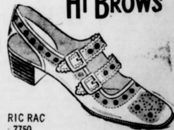
RIC RAC 7750 7755