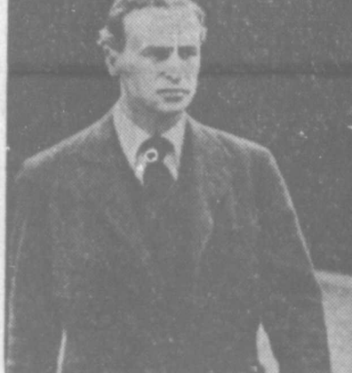
SIR ARCHIBALD SINCLAIR "Perfect timing, courage, surprise."

Something brand new in warfare had been developed by the British who went across the channel, knocked out an important German radio location post 12 miles from LeHavre, France, got back to Britain again with only two men slightly