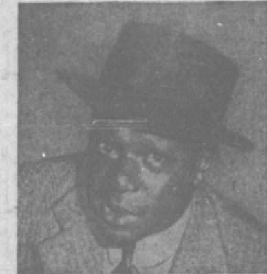
EDDIE ANDERSON (Rochester)

When Jack Benny takes his Sunday night radio show to army camps the member of the cast who has the most fun is Rochester; the soldiers