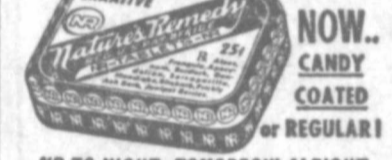
NR TO-NIGHT; TOMORROW ALRIGHT

In NR (Nature's Remedy) Tablets, there are no chemicals, no minerals, no phenol derivatives. NR Tablets are different—act different. Purely vegetable—a combination of 10 vegetable ingredients formulated over 50 years ago. Uncoated or candy coated, their action is dependable, thorough, yet gentle, as millions of NR's have proved. Get a 25c box today... or larger economy size.