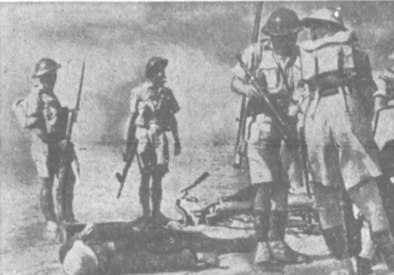
The above radiophoto from Cairo, Egypt, shows one result of the initial Allied thrust against the Axis in the western desert. A member of Marshal Rommel's Afrika Korps lies dead in the dust following the capture of a forward strong point in the Nazi lines.

EDITOR'S NOTE: When opinions are expressed in these columns, they are those of Western Newspaper Union's news analysts and not necessarily of this newspaper. Released by Western Newspaper Union.