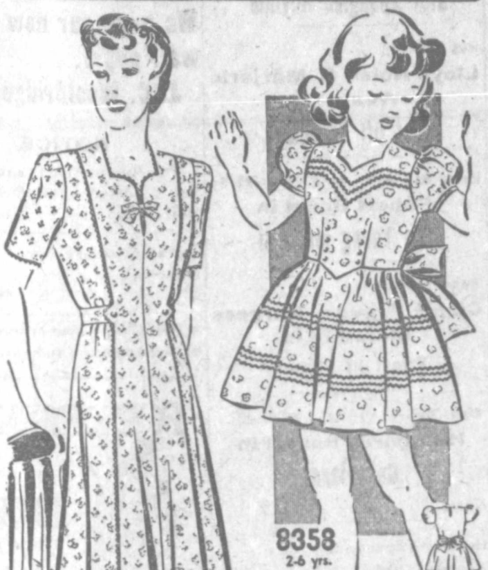
8358 2-6 yrs.

Fetching Dress. YOUNGSTERS will look as pretty and graceful as a ballet dancer in this fetching dress. The heart shape of the neckline which is repeated at the waist, is a darling idea and the profuse use of ric-rac is certain to delight the wearer.