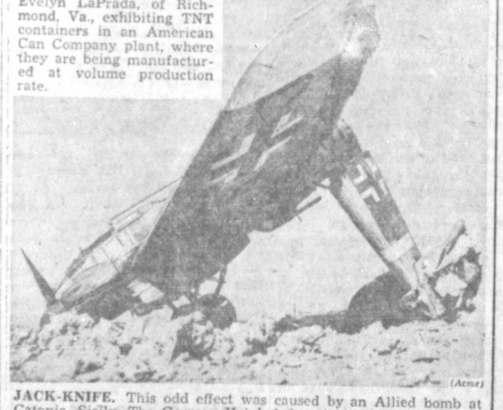
JACK-KNIFE. This odd effect was caused by an Allied bomb at Catania, Sicily. The German Heinkel does look like a jack-knife.

THE LOW DOWN FROM HICKORY GROVE Tide where the Gov. owns one