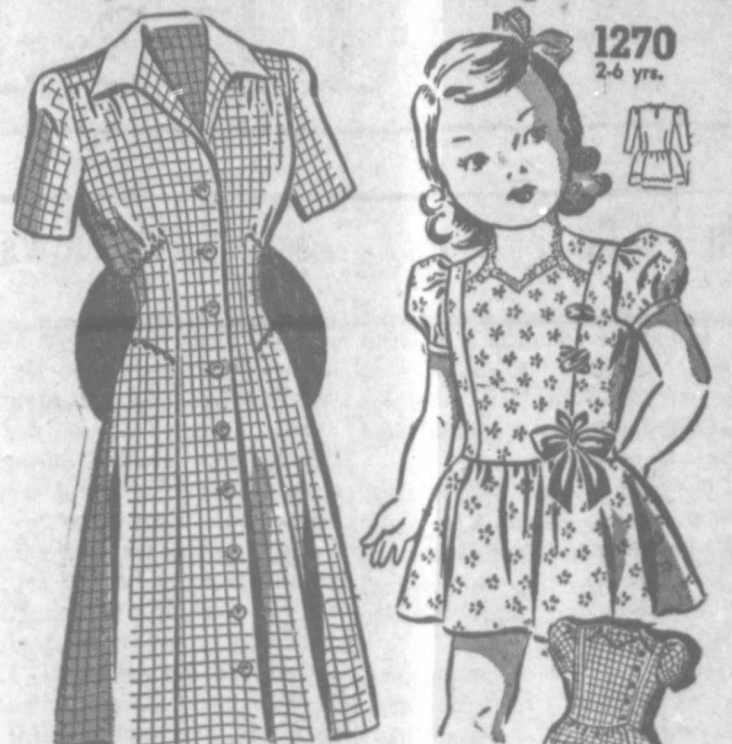
1270 2-6 yrs.

Button-Front Frock YOU'LL look pretty at this fitted button-front frock. The smooth lines and action back are designed for comfort and freedom. Pattern No. 1244 comes in sizes 32, 34, 36, 38, 40, 42, 44 and 46. Size 34, short sleeves, requires 3/4 yards of 35 or 39 inch material; 1/4 yard contrasting material for collar.