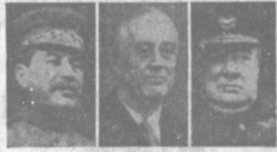
Chieftains Stalin, Roosevelt and Churchill in confab.

As Swedish reports played up a big shakeup in the German government in an effort to form a more respectable regime for approaching the Allies for peace, the Big Three conference continued in the Black Sea area, with Messrs. Roosevelt, Churchill and Stalin announcing completion of plans for the knockout of the Nazi military machine. Although Hitler would remain as the head of the German state under the reported shakeup, actual power would pass into the hands of wily Fritz von Papen, ace diplomat and Reich chancellor before the Fuehrer's ascension to dominance. Although a conservative in tone, Von Papen, reports had it, would have as Finance Minister Hjalmar Schacht, who devised the Reich's