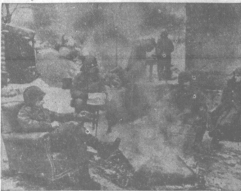
Members of Fifth division of Third army warm themselves about bonfire in Luxembourg comfortably ensconced in furniture salvaged from the town's debris.

Released by Western Newspaper Union. (EDITOR'S NOTE: When opinions are expressed in these columns, they are those of Western Newspaper Union's news analysts and not necessarily of this newspaper.)