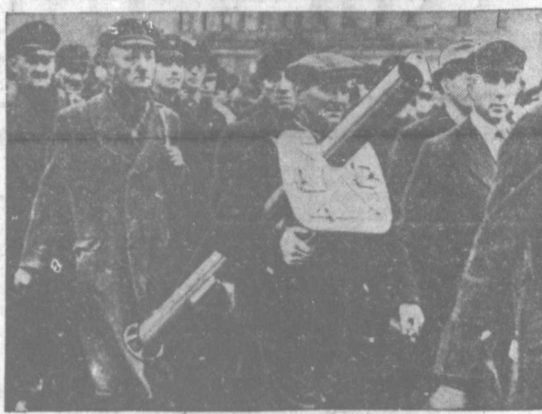
With one member carrying cumbersome anti-tank weapon, Berlin home-guarders mobilize for action as Russ march on capital.

Released by Western Newspaper Union. (EDITOR'S NOTE: When opinions are expressed in these columns, they are those of Western Newspaper Union's news analysts and not necessarily of this newspaper.)