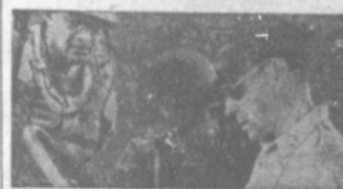
General MacArthur (right) studies maps with aides on Luzon.

In one of the landings, U. S. troops overran the Subic Bay area, which opened up a big harbor for naval use and supply of American forces above Manila, while the other land-