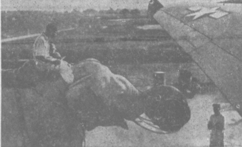
Able to perform the work of 12 coolies, this elephant loads gas drums on American transport command plane flying supplies to troops in Burma.

Released by Western Newspaper Union. (EDITOR'S NOTE: When opinions are expressed in these columns, they are those of Western Newspaper Union's news analysts and not necessarily of this newspaper.)