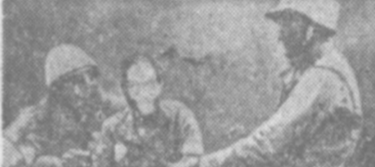
With face distorted according to censorship rules, Jap prisoner receives smoke from U. S. marines on Iwo Jima.

Having overrun the southern half of Iwo Jima, battle-hardened marines pressed the remnants of 20,000