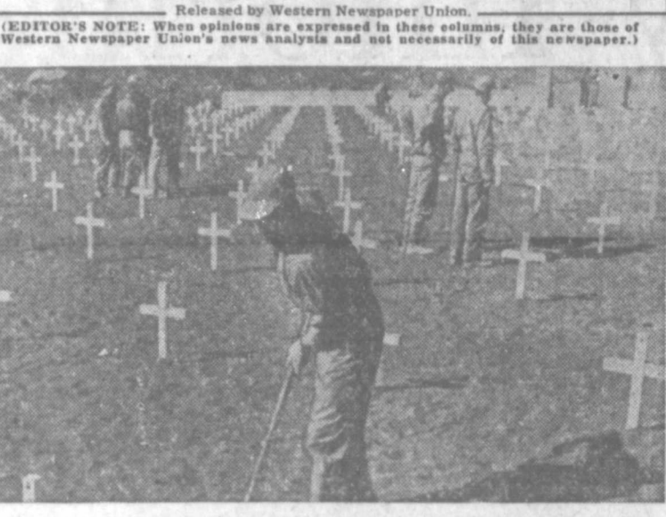
Indicative of high cost of taking Iwo Jima is this marine graveyard on the island, with row upon row of little white crosses.