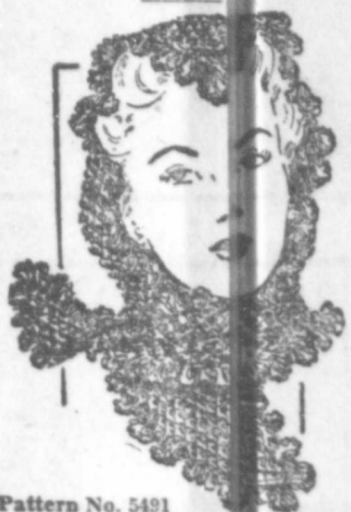
Pattern No. 5491

FASCINATORS are beginning to pop out—all sizes, shapes and colors, but for sheer charm and face-framing effect the triangular fascinator crocheted in soft open-work stitch still takes the cake. You need just two ounces of yarn.