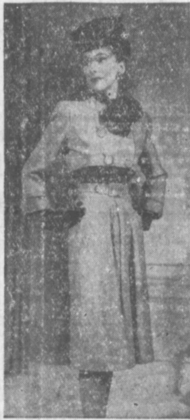
The ever popular bolero suit appears in a Nettie Rosenstein version with a double-breasted box bolero over a brown crepe top dress of light blue wool. The straw hat with the perky veil is in keeping with the neatness of the suit.

The style of the dressing table skirt depends upon your own individual taste. If you go in for tailored things, then you will dispense