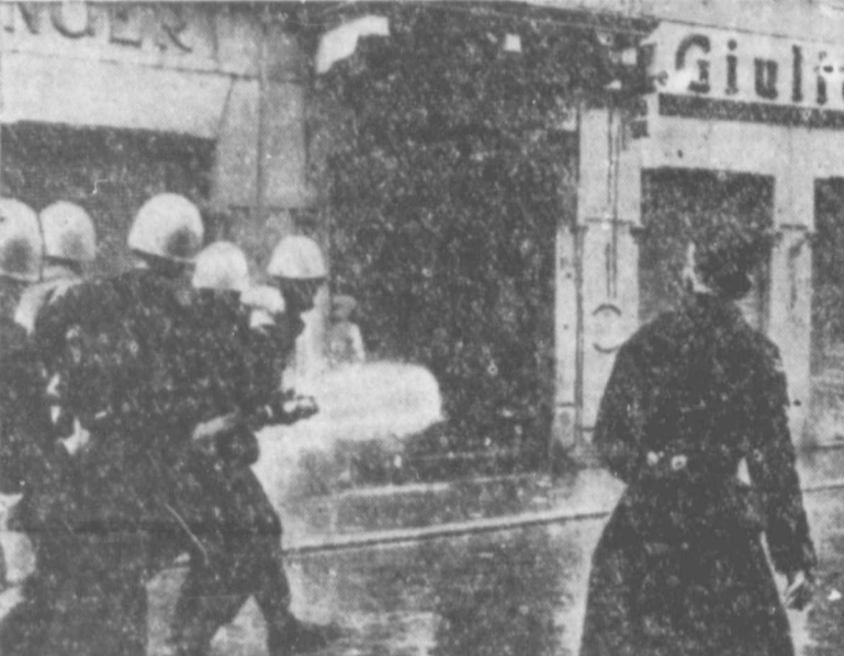
Presently held by Italy but sought by Yugoslavia, strategic Adriatic port of Trieste has been troublesome bone of contention in the peace-making. During visit of United Nations commission to area, Yugoslavs staged rally demanding port and civil guards are shown dispersing straggling demonstrators with fire hose.

Released by Western Newspaper Union. EDITOR'S NOTE: When opinions are expressed in these columns, they are those of Western Newspaper Union's news analysts and not necessarily of this newspaper.