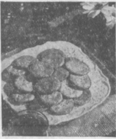
Cookies made from the new emergency flour tend to be darker in color but they can be made acceptably if directions are followed.