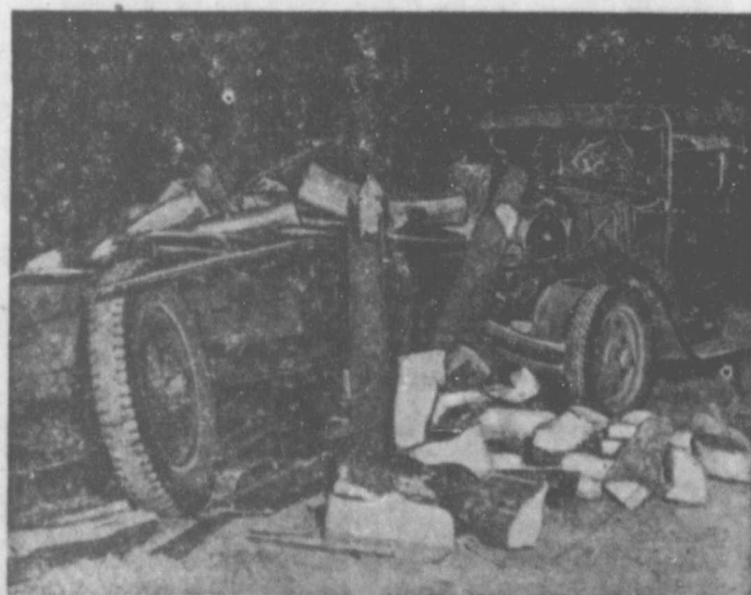
This unlighted trailer, moving slowly along the darkened highway, was completely invisible to an overtaking motorist as he came suddenly upon it from around a corner. He crashed into it and was fatally injured. Just one more of the many bitter ironies of highway deaths, where a lawbreaker who was indifferent to his own safety and the safety of others escaped injury, while an innocent victim paid for that indifference with his life.