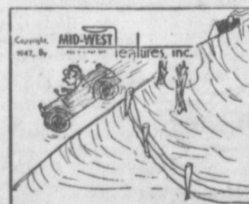
"I paid $400 for a dog — part collie and part bull."