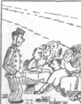
"I'm not bothering these people just to look for a caramel—My teeth are in it!"