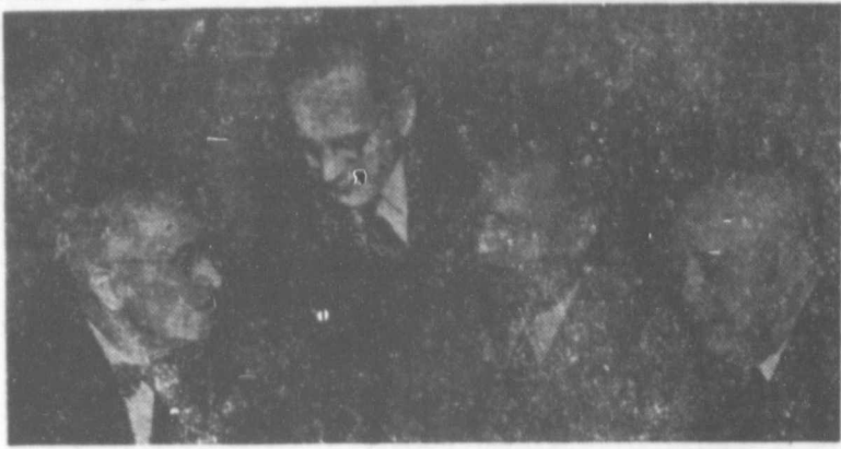
CONGRESSIONAL LEADERS PARLEY—These are the men who will chart and develop legislation to implement the Democratic party's platform pledges. Shown in a pre-congress opening conference are, left to right, President Truman; Rep. John W. McCormack (D. Mass.) house majority leader; Sen. Scott W. Lucas (D., Ill.), senate majority leader and Speaker Sam Rayburn (D., Texas.)

(EDITOR'S NOTE: When opinions are expressed in these columns, they are those of Western Newspaper Union's news analysts and not necessarily of this newspaper.)