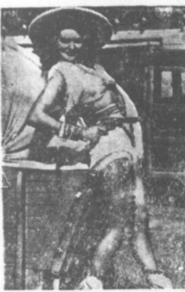
Dorothy Malone, in typical Hollywood garb—that is for picture releases such as this—was the first film player to be accorded stardom in 1949. Warner Brothers, her bosses, elevated her to film's top pinnacle for her performance in the film "One Sunday Afternoon."

THE MINISTERS' petition, sponsored by the Euthanasia Society of America, declared that the "ending of physical existence of an individual at his request, when afflicted with an incurable disease which causes extreme suffering is under proper safeguards not only medically indicated but also in accord with the most civilized and humane ethics and the highest concepts and practices of religion."