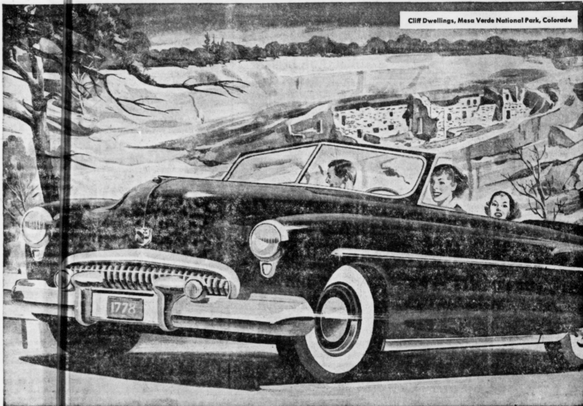
Cliff Dwellings, Mesa Verde National Park, Colorado