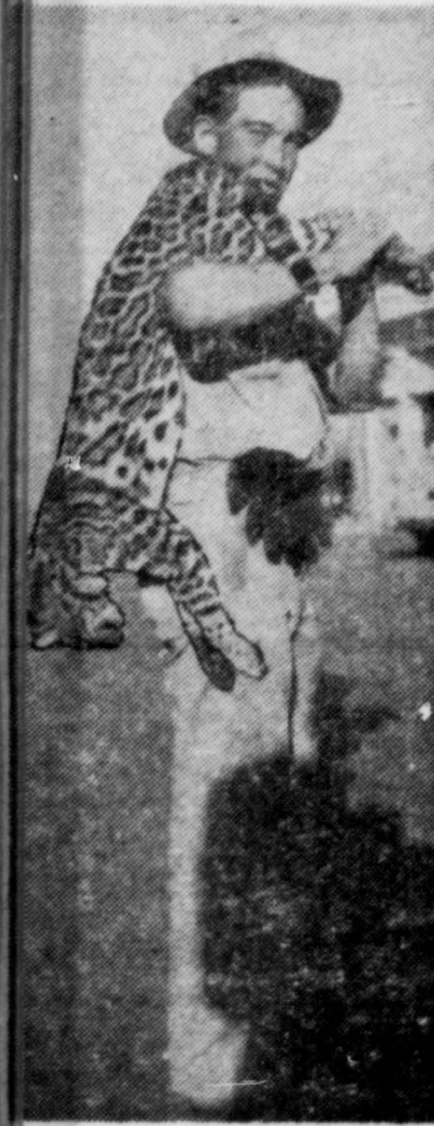
Above is a picture of Arthur Wingle with the ocelot which he killed recently on the H. Hoggard place, 2½ miles northeast of town. The animal was flushed from a clump of weeds near a cotton patch. Wingle ran to the nearby Gerald Bland farm where he was staying, got a shotgun and returned to shoot the big cat out of a tree where it had taken refuge.

The ocelot ranges from Texas to the southern tip of South America, but it is unusual to find one in the Panhandle. The animal above weighed about 45 pounds and was 4½ feet long. Wingle plans to have its skin stuffed.