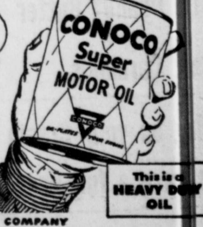
This is a HEAVY DUTY OIL