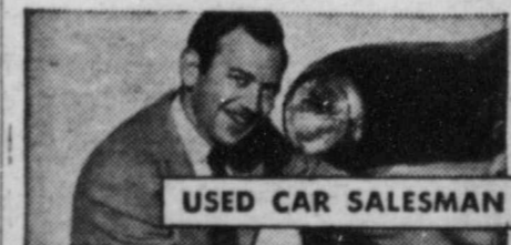
USED CAR SALESMAN

After a punishing 50,000-mile road test, with proper drains and regular care, engines lubricated with new Conoco Super Motor Oil showed no wear of any consequence: in fact, an average of less than one one-thousandth inch on cylinders and crankshafts. AND gasoline mileage for the last 5,000 miles was actually 99.77% as good as for the first 5,000!