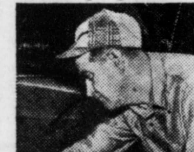
"After overhaul, Conoco Super customers drive 50,000 more miles"—R. K. Comstock, Oklahoma City.