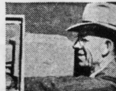
"Changed to Conoco Super, driven 29,000 miles without trouble", writes I. W. Banard, Fort Smith, Ark.