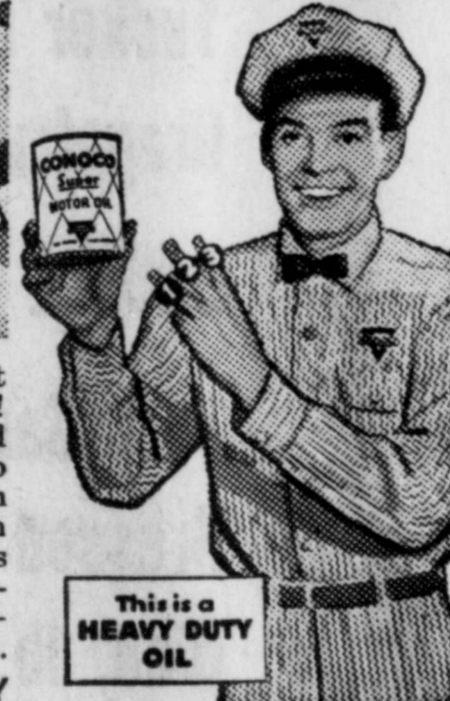
This is a HEAVY DUTY OIL

3 He'll refill with great Conoco Super Motor Oil! Conoco Super is fortified with additives that curb dangerous accumulation of dirt and contamination—protect metal surfaces from corrosive combustion acids—fight rust—OIL-PLATE against wear.