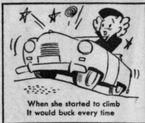
When she started to climb It would buck every time