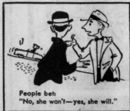
People bet: "No, she won't—yes, she will."

Then I got Conoco's NEW 1-2-3 "50,000 Miles No Wear" Service!