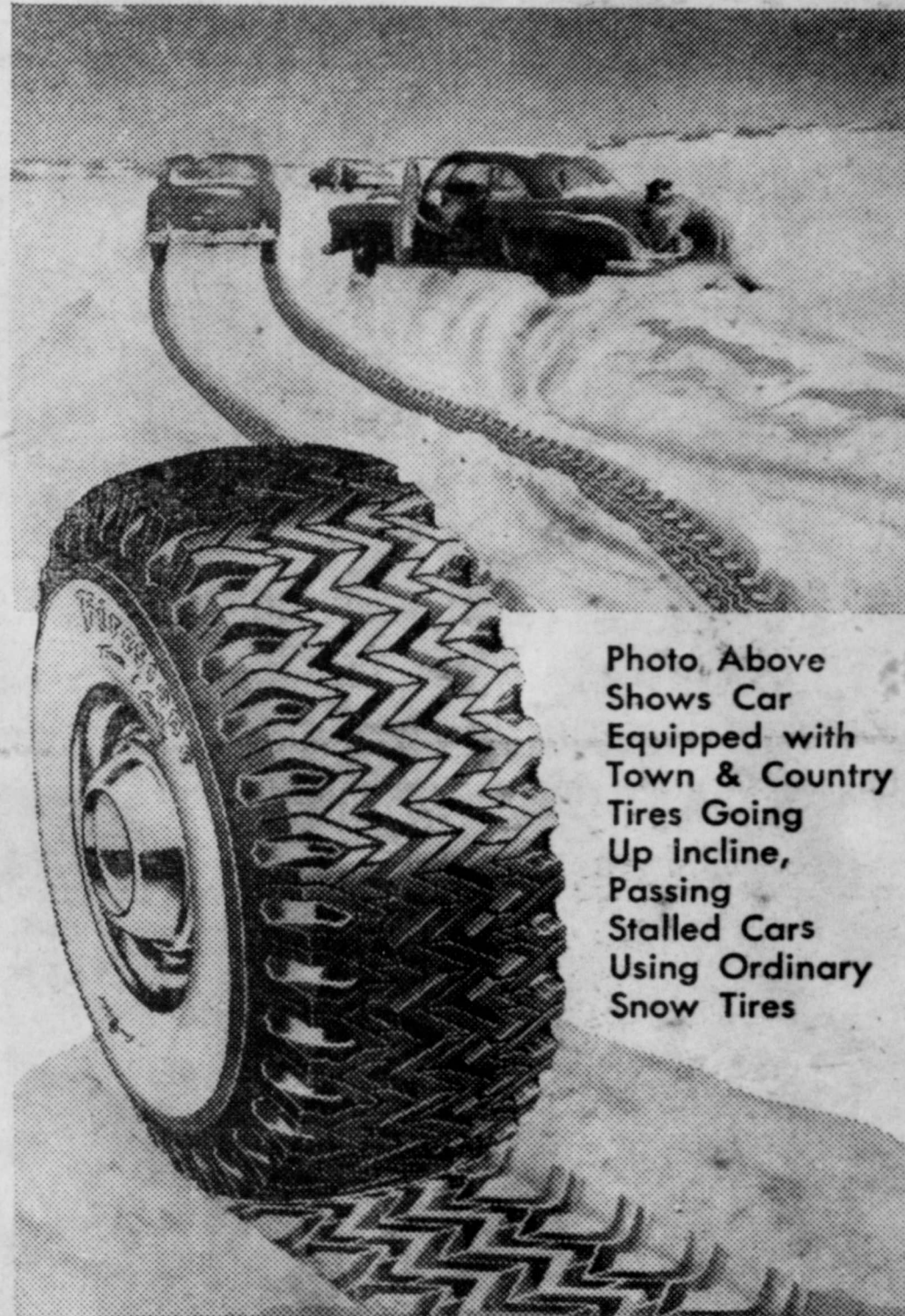
Photo Above Shows Car Equipped with Town & Country Tires Going Up Incline, Passing Stalled Cars Using Ordinary Snow Tires