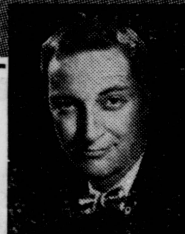
This is the big offer Garry Moore talks about every Monday on his CBS-TV network show.