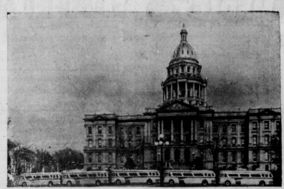
Colorado's golden-domed Capitol forms an impressive background for Continental Trailways' new fleet of "Airide" buses being placed in service on the company's Pikes Peak route between Denver and Dallas, Texas. State officials were given a preview of these first five coaches prior to their departure from Denver on an exhibition tour along the

able at City Grocery in Hedley or Food Market in Clarendon. Hedley, I CARS