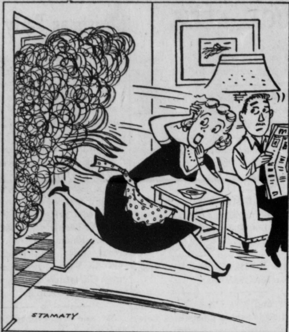
"QUICK! -FRANKLIN - WHERE IS THAT BOOK ON FIRE PREVENTION?"