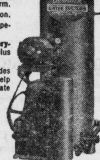
Deep Well Reciprocating Pump