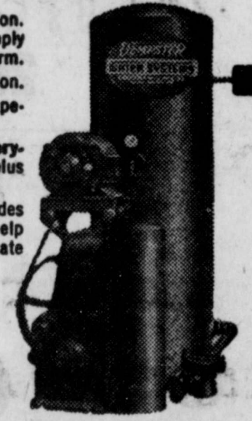
Deep Well-Reciprocating Pump

SEE THE NEW PRIME-O-JET MOFFITT HARDWARE COMPANY