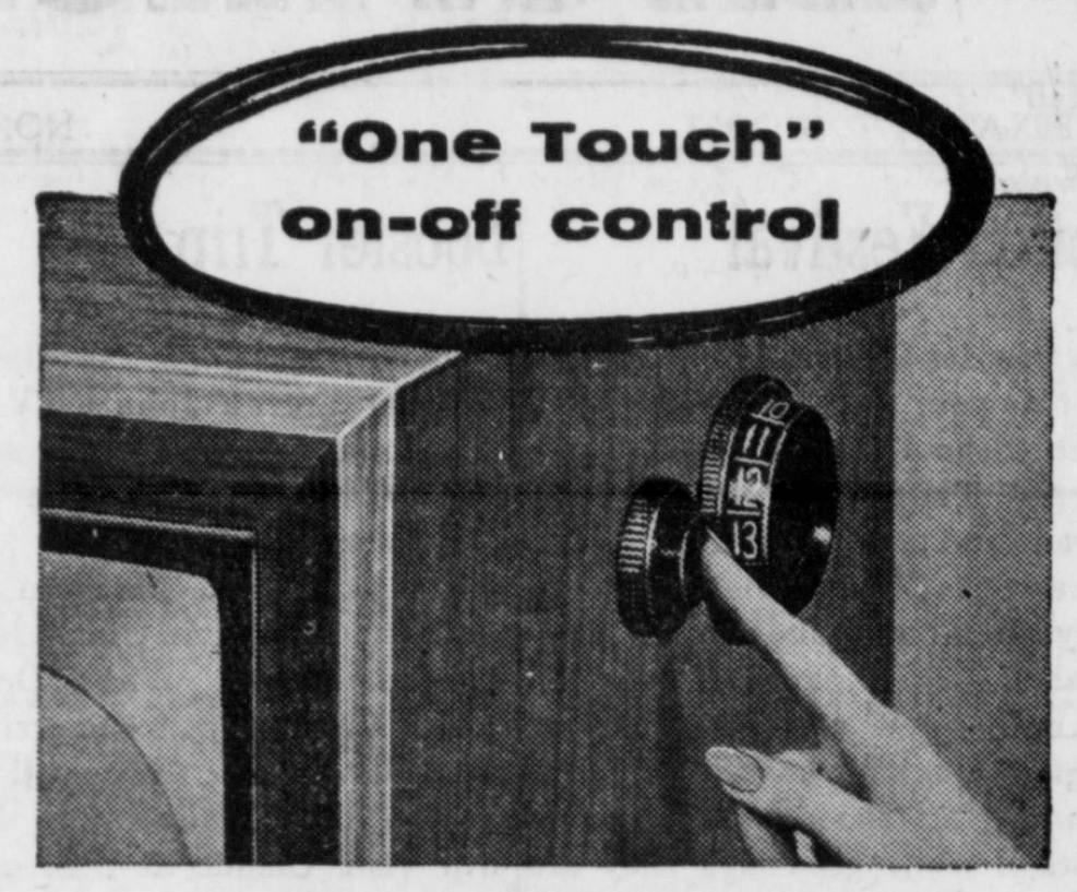
An important new feature in