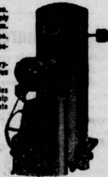
Deep Well Reciprocating Pump

Running water is the first step in farm modernization. Remember these advantages of DEMPSTER Water Supply Equipment when you consider running water for your farm. Economical ... Low in initial price and cost of operation. Dependable ... Backed by more than 70 years of experience in the water supply industry. Complete Line ... Pumps, pipe, fittings, tanks—everything you need for the entire installation, plus the complete service that goes with it. FREE Water Survey ... Your DEMPSTER service includes a complete water survey of your farm. It will help you select the right water system, and estimate installation and operating costs. Ask us for your FREE Water Survey forms today.