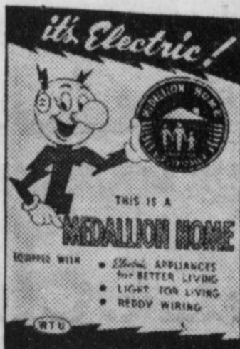
LOOK FOR THIS SIGN IN SELECTING YOUR NEW HOME

LIGHT FOR LIVING is provided for in work, play and traffic areas, to illuminate them for beauty as well as for your family's safety and comfort.