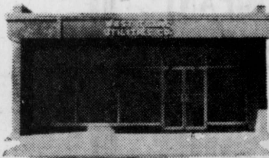
Recently remodeled WTU office at Clyde