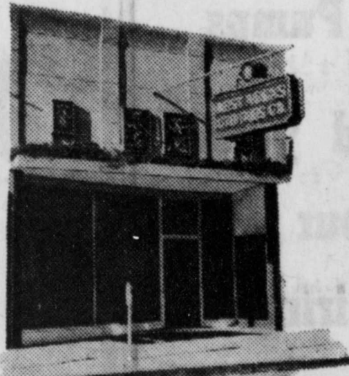
Recently remodeled WTU office at Clarendon