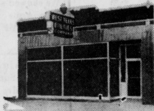
Recently remodeled WTU office at Haskell

West Texas Utilities Company an investor owned company