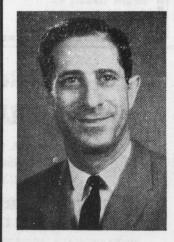
Our District Needs Representation in Austin