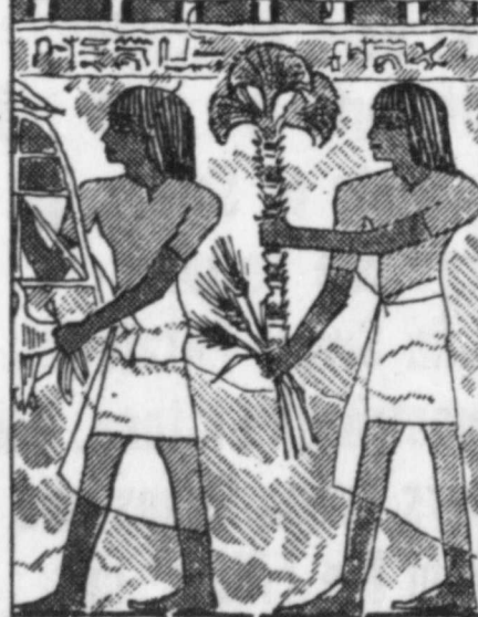
Barley is one of the oldest known grains.

barley production, followed by France, Canada, the United Kingdom, West Ger-many, and Turkey, North Dakota, California, Montana, Minnesota, and Washington are our top barley producing