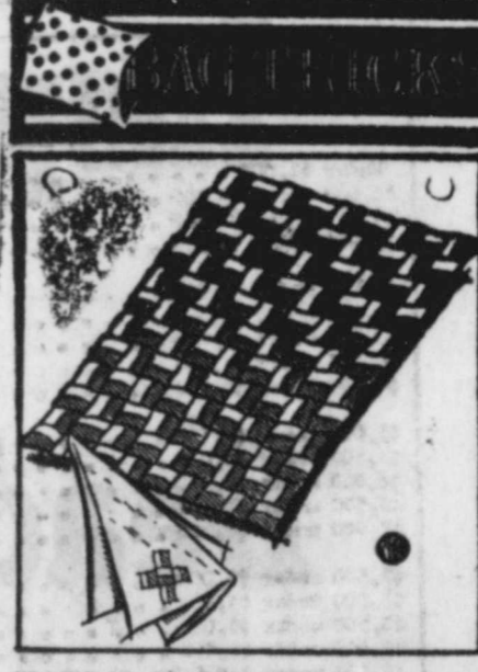
TABLE TALK —Woven placemats, attractive and practical, can be made from printed and solid color cotton feed and flour bags. Cut strips two inches wide, fold to resemble bias tape, and press. You will then have one-half inch strips, with no raw edges. Weave basket-style into mat of desired size. Bind edges with bias tape in coordinated color. Make napkins from print or solid bags and trim with small appliques in contrasting color.