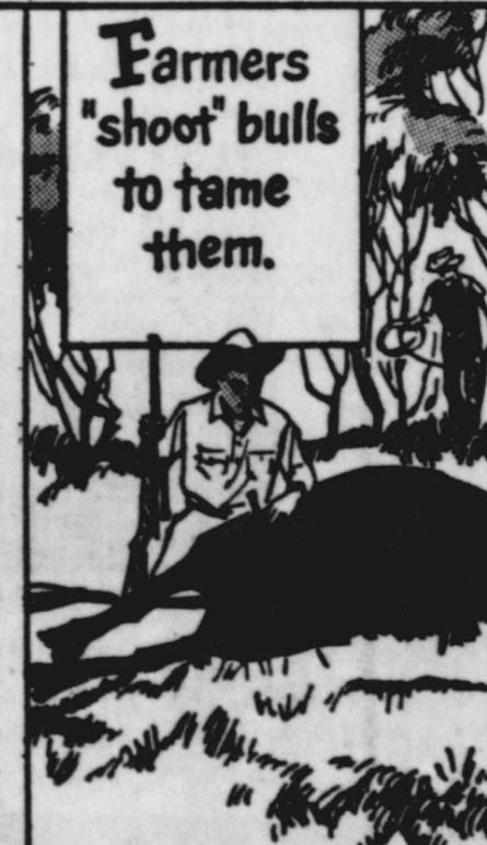
Farmers "shoot" bulls to tame them.

The treatment is relatively painless for the animal. It appears to suffer little, either