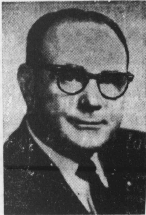
REP. BILL HEATLY

DEDICATED TO HONESTY AND EFFICIENCY IN GOVERNMENT