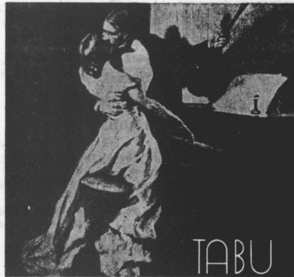
the 'forbidden' fragrance