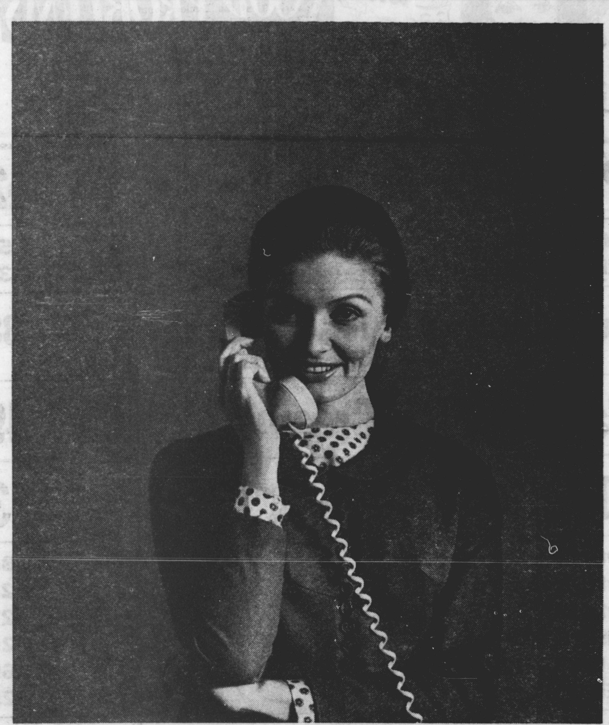
Our customer's representative is a good listener

In case of error in legal or other advertising the publisher does not hold himself liable for damages in excess of the amount received for such advertising.