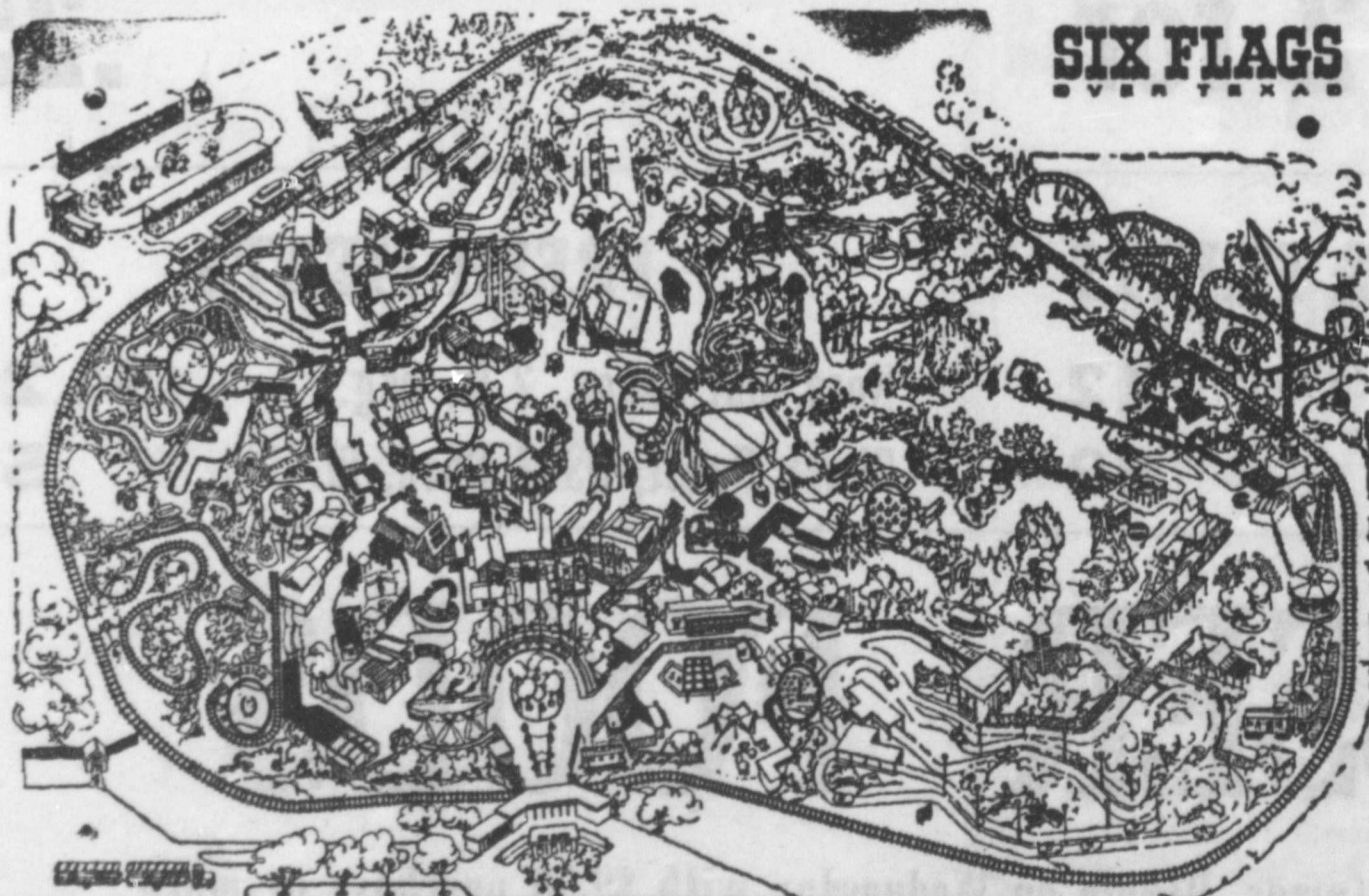
Artist's rendering of 115-acre Six Flags Over Texas located midway between Dallas and Fort Worth. The $14,000,000 historical theme amusement park, now the most popular single tourist attraction in the State of Texas, features more than 75 rides, attractions and shows. An estimated 1.8 million people from all over the United States will visit Six Flags during the 1966 season.