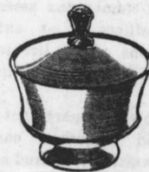
LYRIC CANDY JAR 6" tall. $10.95