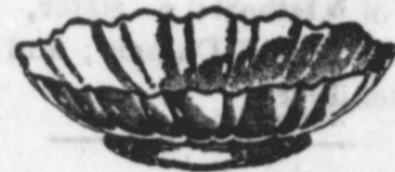
THE SYMPHONY CENTERPIECE 10½" long. $12.95

Lovely Gifts of Lenox China... hand-decorated with 24-k. gold